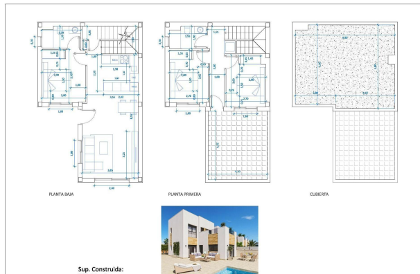
PROMOCIÓN 4 VIVIENDAS CON PISCINA