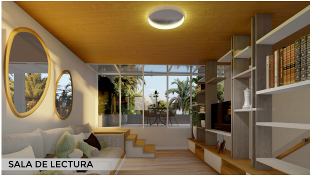
SALA DE LECTURA